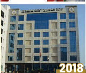
The two pictures show company's headquarters during 20 years

The company launched its slogan for this year (Safety First), to promote safety principles & standards for company's employees in various work sites, because of its importance for their safety & safety of environment around them